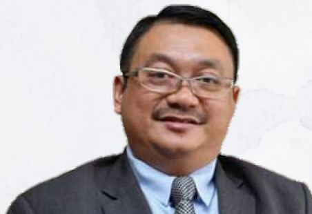
Dato' Amiruddin CEO Cybersecurity Malaysia